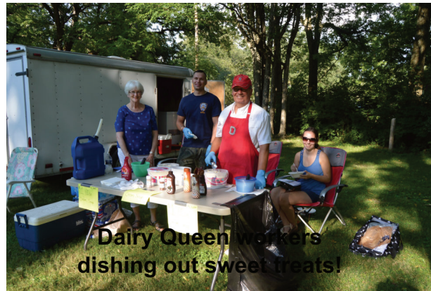
Dairy Queen workers dishing out sweet treats!

It was a perfect evening for the Castle Concert and Ice Cream Social held at Mac-A-Cheek Castle.