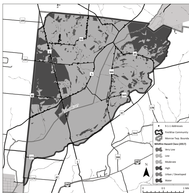
Monroe Mad River workup